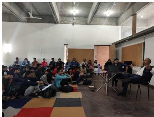
Figure 2: Madhav Sir and Rohit Sir interacting with the students